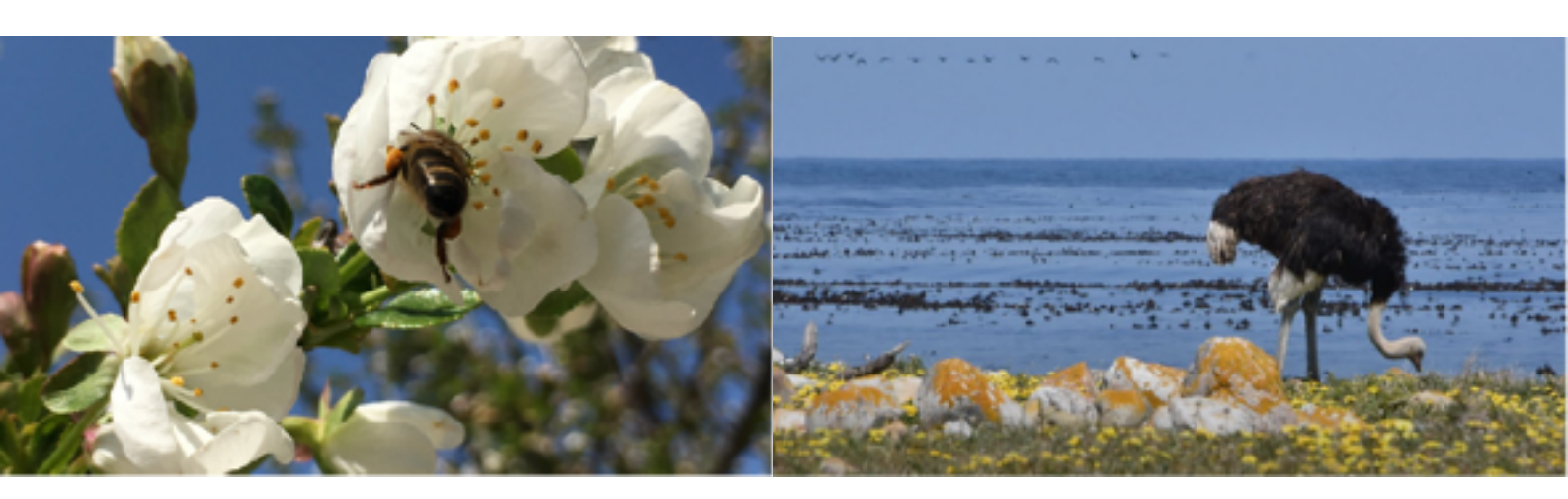
Two entries from the 2022 competition...

We are pleased to announce the theme of the fourth Franco-Brit photo competition: « Water - from ice to steam » - « L'eau dans tous ses états ». In September , you will be informed of the dedicated email address for sending in your entries. The winning entries will be announced at the AGM in October and feature in the Franco-Brit 2024 calendar. The photo competition was first introduced in 2020 during Lockdown and was intended as a means of getting through those difficult months in a positive and pleasant way. A chance remark during Zoom apéro led to the first calendar in 2021. We look forward to seeing your entries in September.