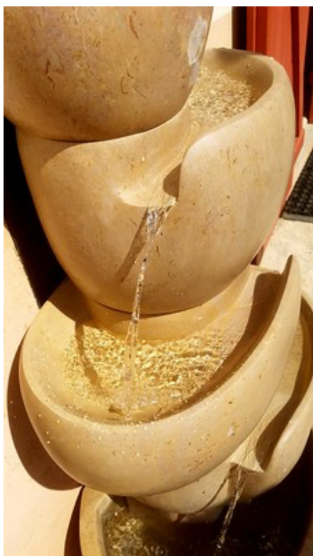
La Fontaine 1 Jacqueline Duault