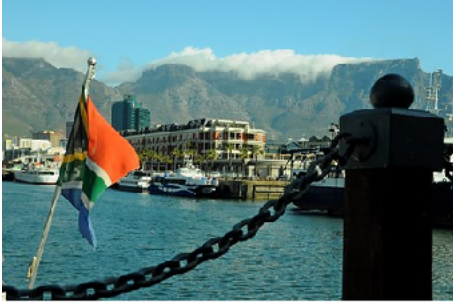
Jean-Rémy Olesen Table cloth over Table Mountain