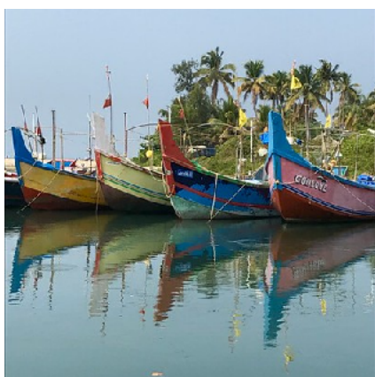
Water reflecting fishing boats Zsu Quillery